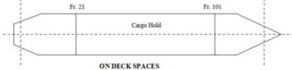
ON DECK SPACES