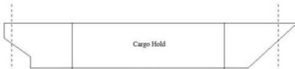
Fr. 21 UNDERDECK SPACES