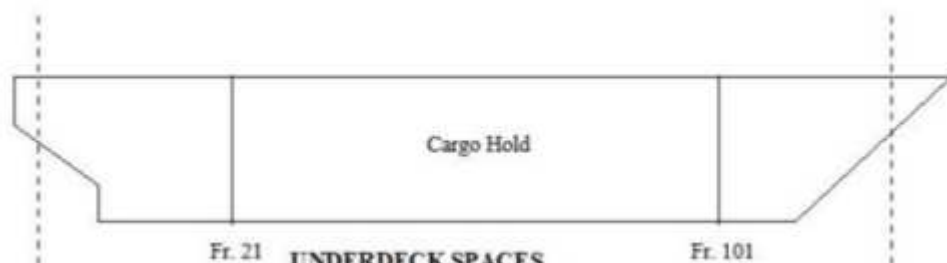
Fr. 21 UNDERDECK SPACES